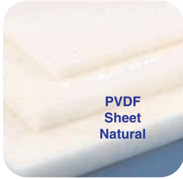
PVDF Sheet Natural