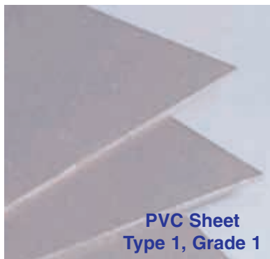
PVC Sheet Type 1, Grade 1